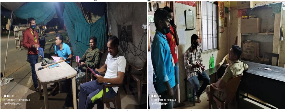
Fig: Outreach at Police during night