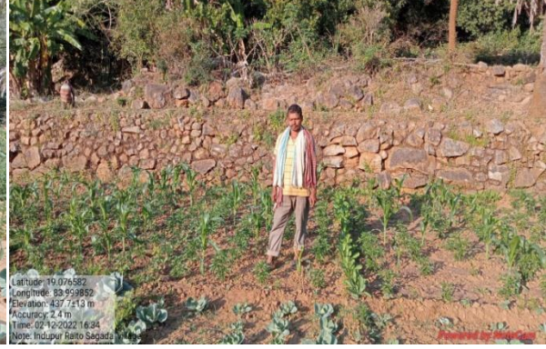
Mixed Cropping of Cabbage-Sweet Corn & Chili-Sweet Corn