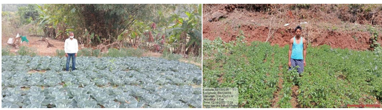
Cabbage & Chili Crops