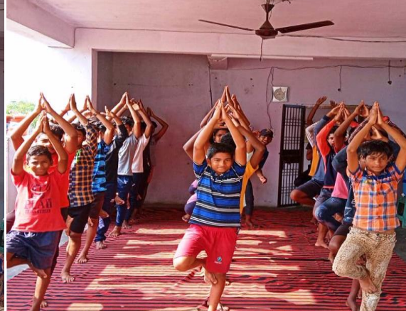
Fig: Yoga, Exercise in morning time during Sundays