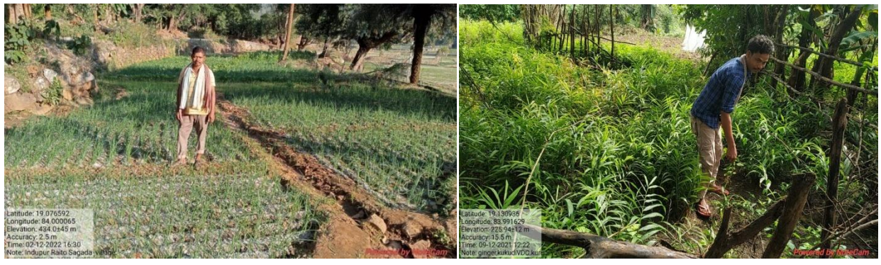
Onion & Ginger Crops