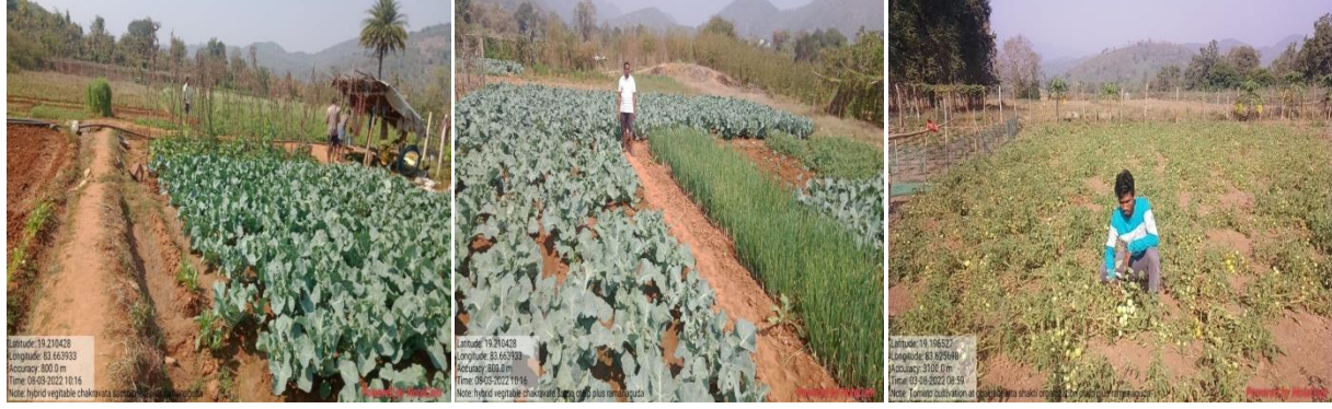
Fig: Crop demonstration of hybrid vegetables at Chakrabhatta village