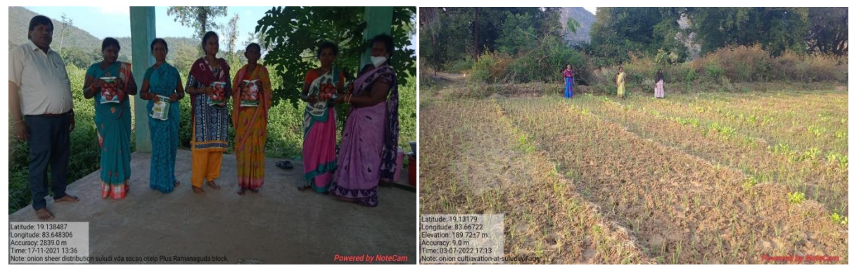
Fig: Crop demonstration of Onion through distribution of quality seeds