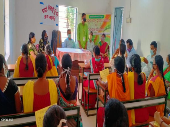
Fig: Outreach at AWW Sector Meetings