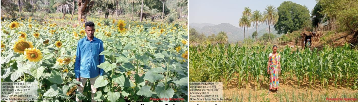
Sunflower & Sweet Corn Crops