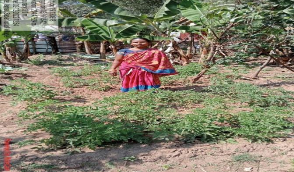
Banana & Tomato Crops