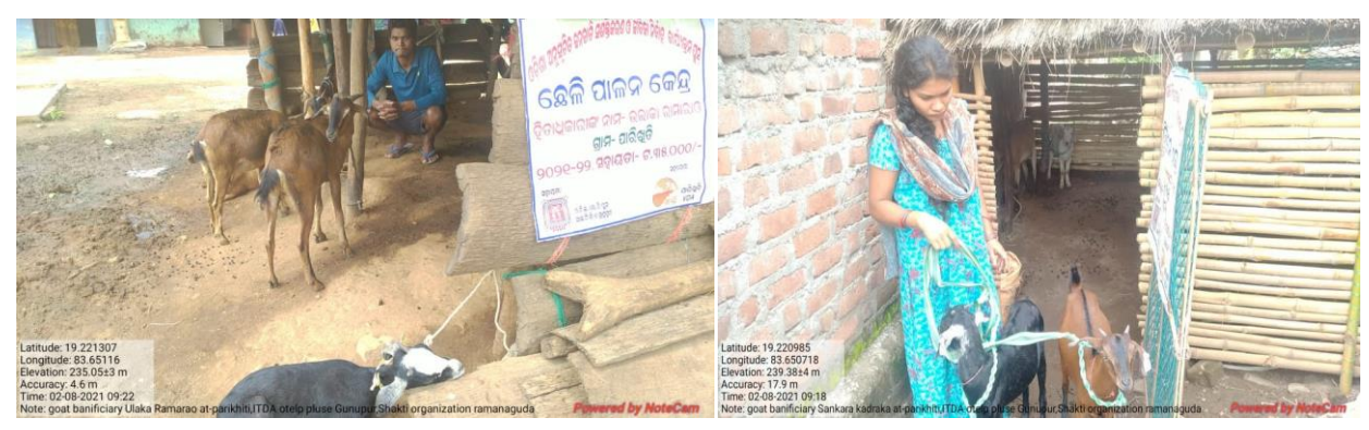
Fig: Goat Farming units at Parikhiti & Kariniguda villages