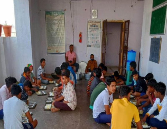
Fig: Bed facility and food facility at the Hostel