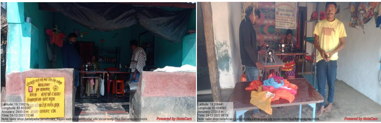
Fig: Stitching Units at Podalpadar and Kamanguda villages