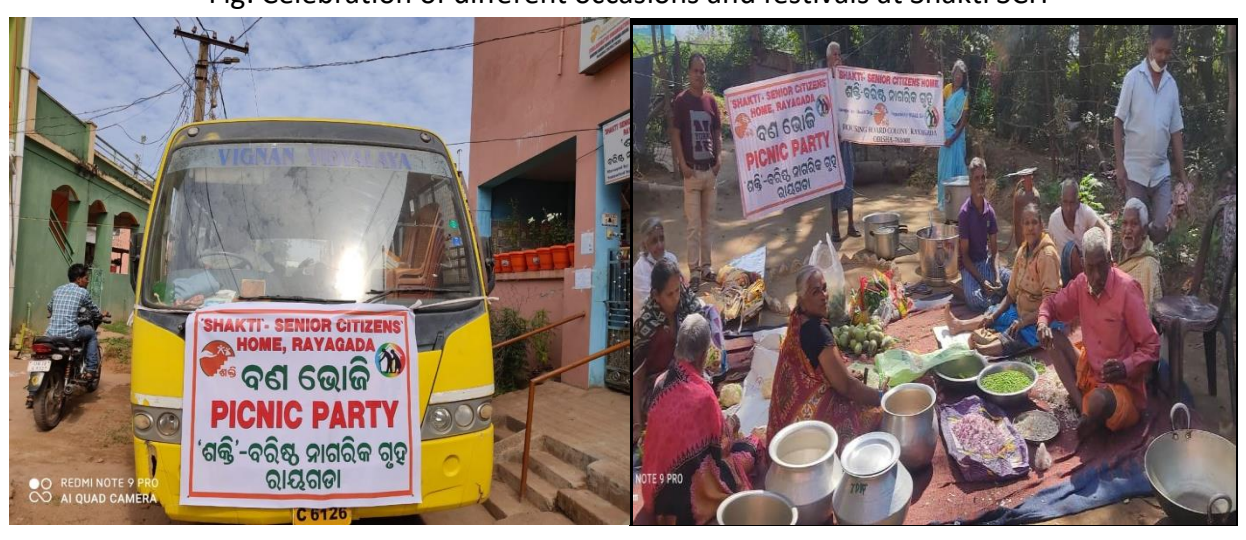
Fig: Arrangement of Picnic for inmates of Shakti SCH