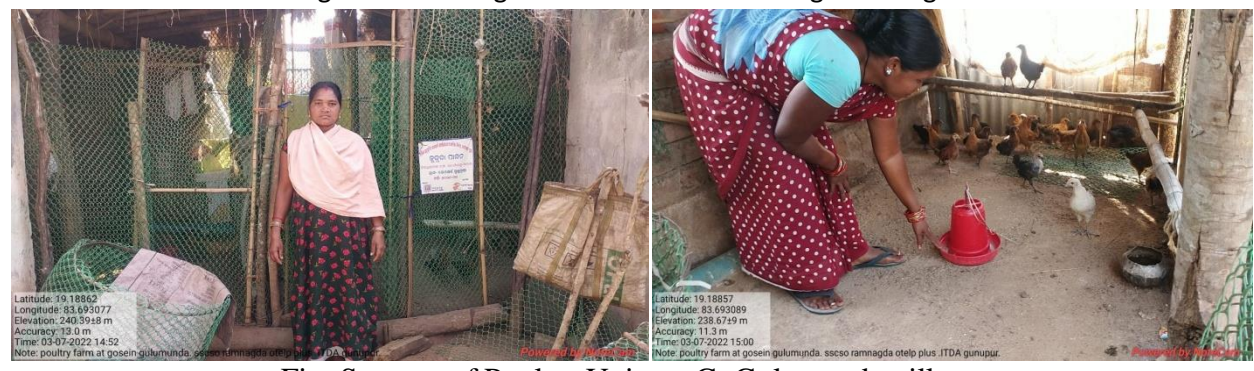
Fig: Support of Poultry Units at G. Gulumunda village