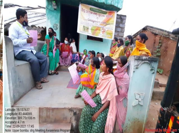
Fig: Outreach at SHG Meetings