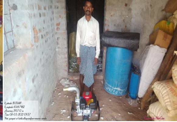
Fig: Distribution of Motor pumps at VDAs