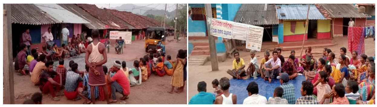
Fig: Formation of FRCs through conduction of Gram Sabhas

The objective of this project is to fight for the rights of indigenous community over forest land they are dwelling year after year from their ancestors. We facilitate the Community Forest Right activities through FOGGO Network (Forum for Green Governance in Odisha) & with support of Foundation for Ecological Security(FES). Operational Area-Rayagada Block of Rayagada District Achievement- Total 80 numbers of Forest Right Committee (FRC) have been formed in 6 Gram Panchayats of Rayagada Block through conduction of Gram Sabhas followed by preparation of documents to be submitted at SDLC.