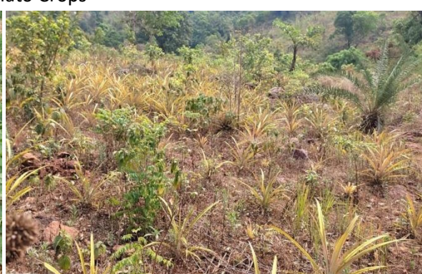
Watermelon and Pineapple Crop