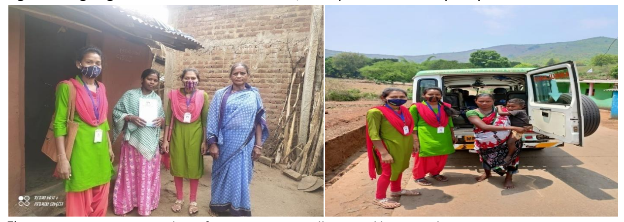
Fig: Motivation cum Counseling of cases at remote villages and bringing them to Maternity Waiting Home by the staffs of Maa Gruha through the help of Government Ambulance