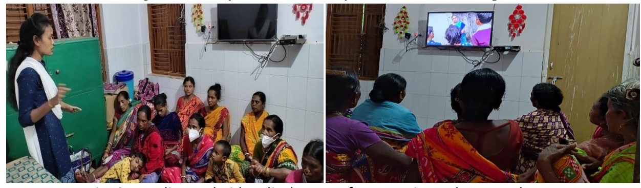
Fig: Counseling and Video display on safe maternity and maternal care