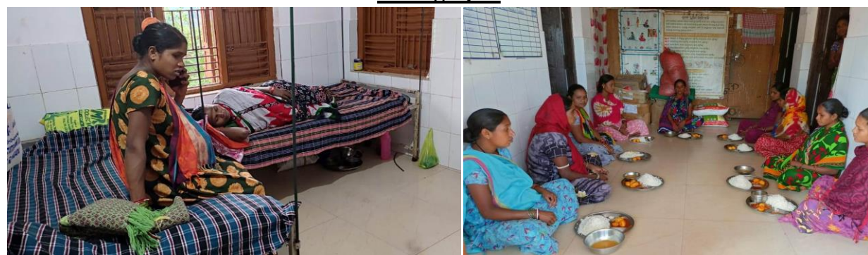
Fig: Bed facility and Food facility at Maa Gruha, Kashipur