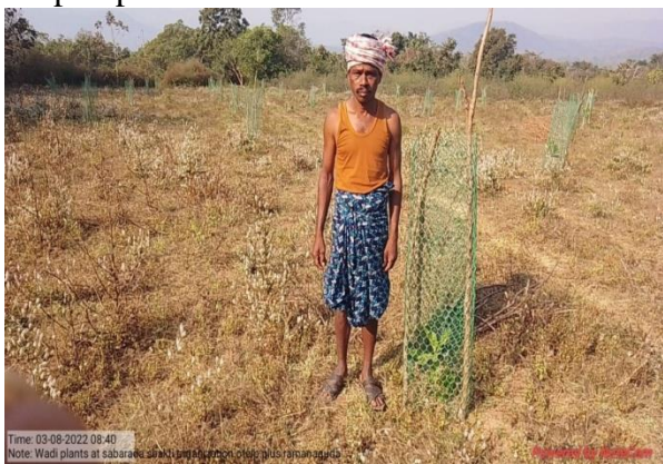
Fig: WADI Plantations of Mango and Cashew