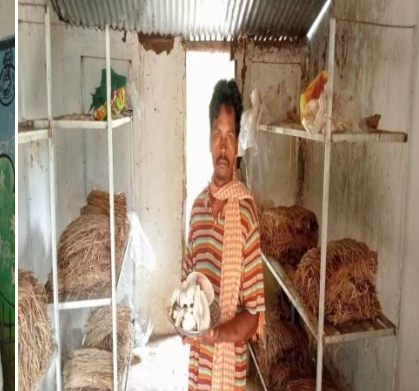
Mushroom Units at different villages