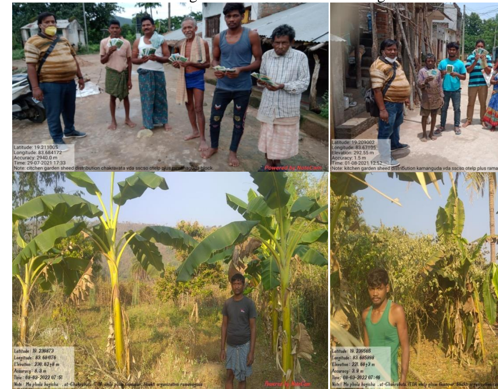
Fig: Development of Mo Phala Bagicha through support of seeds and guidance