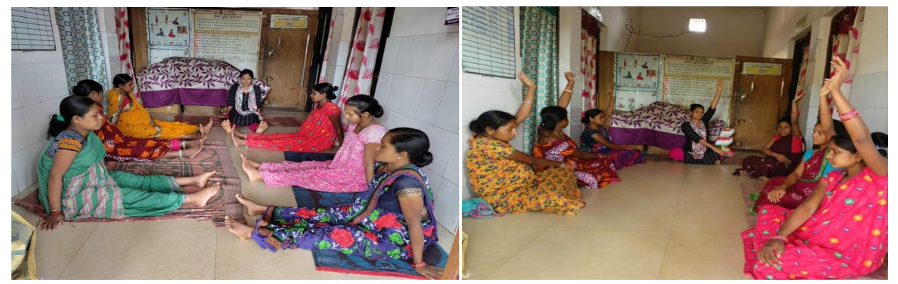
Fig: Morning Yoga and Exercise at Maa Gruha, Kashipur conducted by Lady Health Assistant