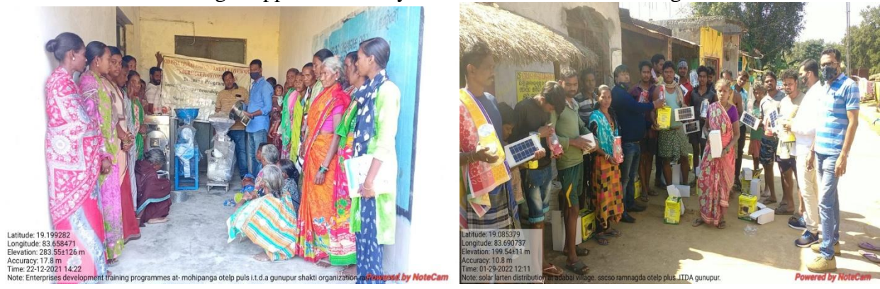
Fig: Multipurpose Processing Unit at Mahipanga & distribution of Solar Lanterns at Adabai