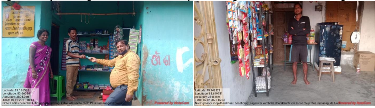
Fig: Ladies Corner & Grocery Shop at Katiki & Dharakhunti villages