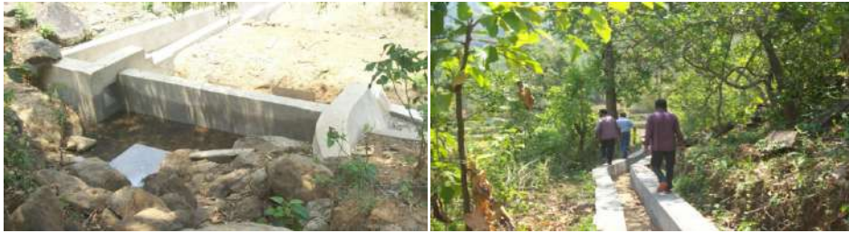
Fig: Renovation of Diversion weir at Abati and Angara