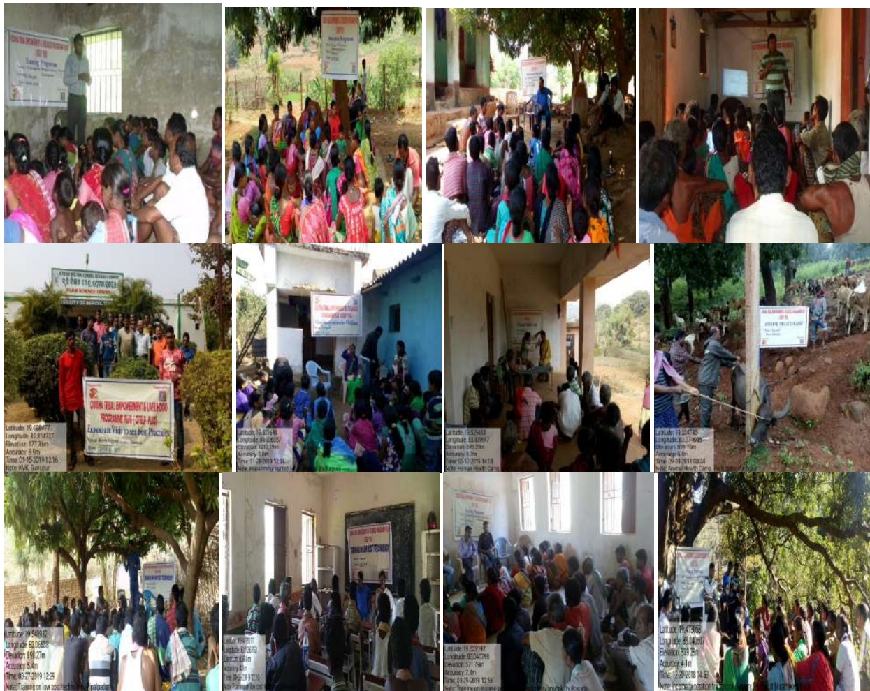
Fig:- Different CB Programmes during FY 18-19

Total 74 nos. of Awareness, Training Programme and Exposure visit were conducted in different Programme villages of OTELP PLUS area during FY 2018-19 including both community empowerment and beneficiary skill up-gradation. The theme of the CB Programmes covered Animal health Camp, Human Health Camp, Deworming of cattle, Awareness on sanitation, pregnant women and lactating mother, dengue, malaria, diarrhoea, Training on horticulture, agriculture, goatery, poultry, low cost technology and Exposure visit to see best practices. Mass Immunization of livestock conducted at Programme villages during Animal Health Camp to eradicate viral diseases and to aware people for immunization. Government officials from different sectors like BVO, WAO, Doctor, ANM, Agriculture Overseer, Forester, Livestock Inspector, and Social Worker with expertise participated as resource person and all most all the Programmes were conducted through participatory process with a session for interaction and question answers. Showing videos, posters, and pictures has more effect on rural village level audience rather than only lectures for which such methods were also followed for effectiveness of the capacity buildings of the laymen.