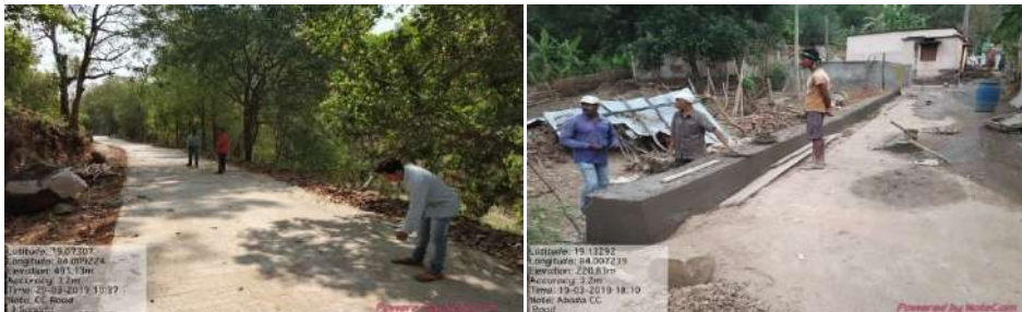
Fig- Const. of CC Road at Sagada to Angara and Const. of CC Road with Side wall