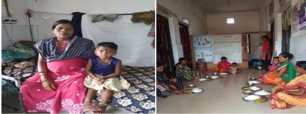
Fig: - Free lodging and fooding facility at MWH, Kashipur