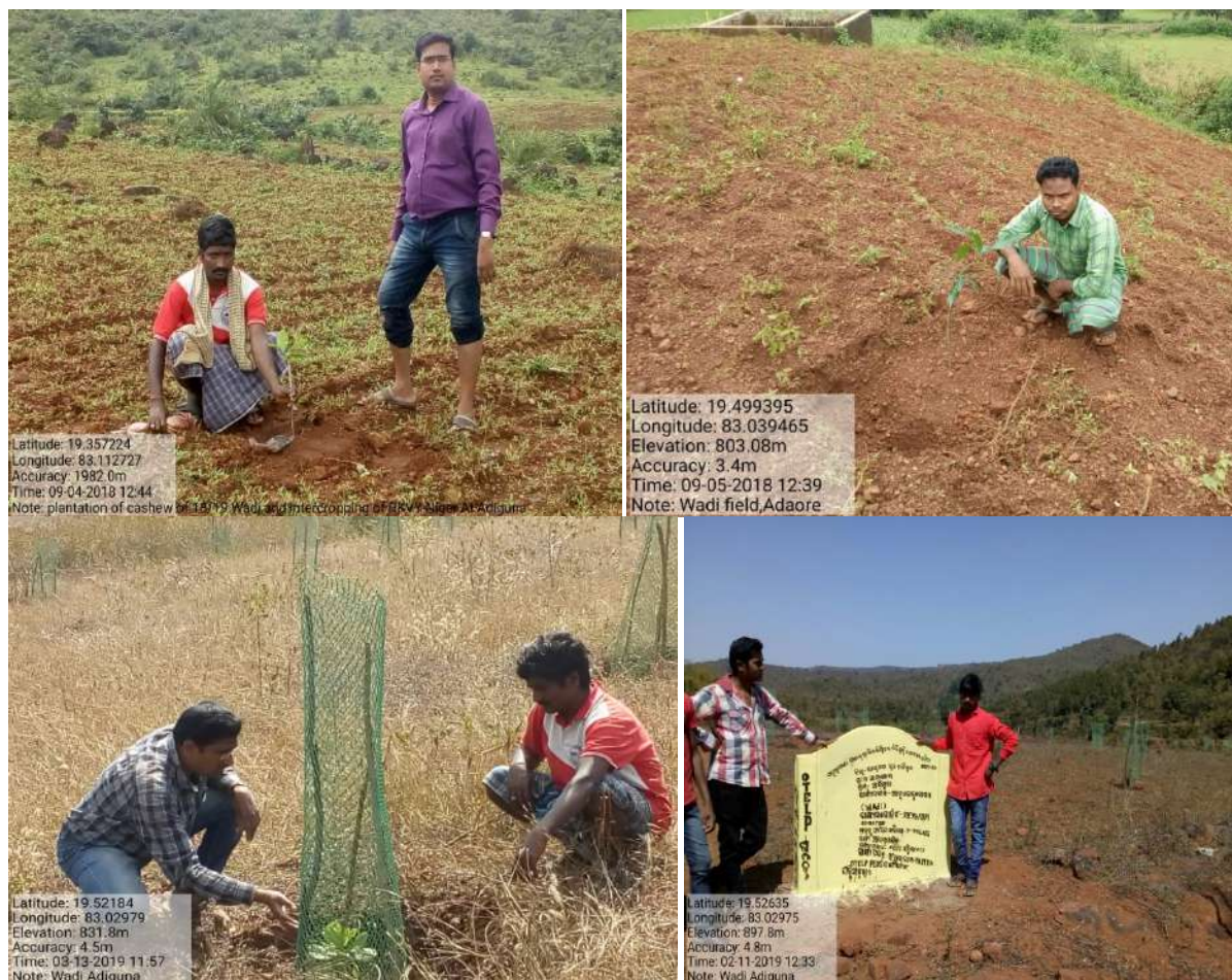
Fig: WADI Plantation at different Villages

Total 20 hectares of mixed plantation (Cashew+Mango) was taken during 18-19 under MGNREGA Scheme covering 22 farmers in 4 villages of Adajore GP. The farmers were supported with grafts, manure, tree guard for sustainability of the plantation.