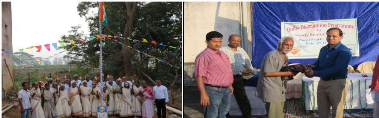
Fig: Republic day celebration and quilts distribution to needy senior citizens