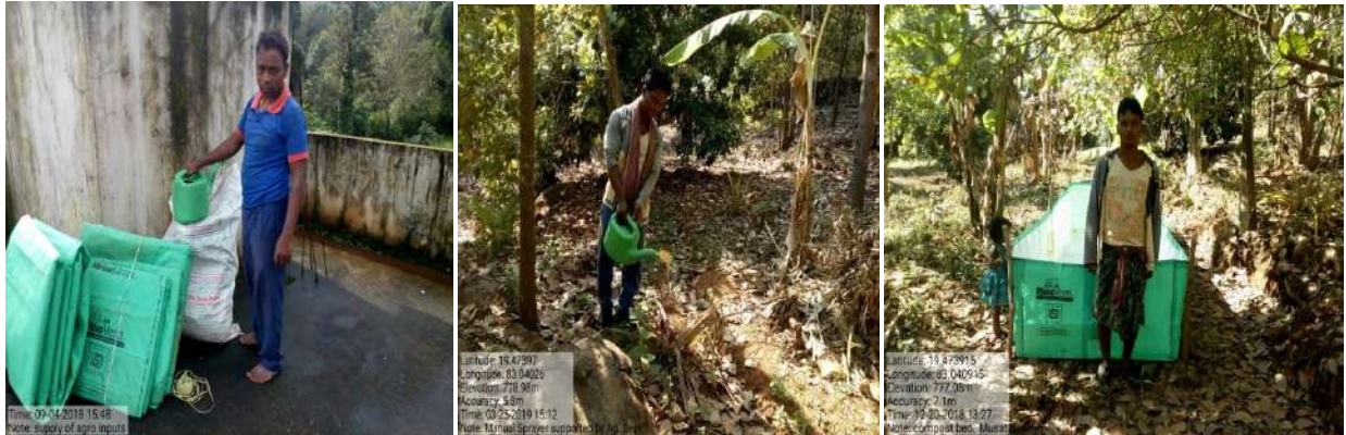
Fig: Supply of Agro inputs like Compost bed and Manual hand sprayers at Musatakiri Village