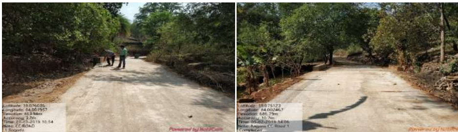
Fig- Construction CC Road at Angara and Sagada