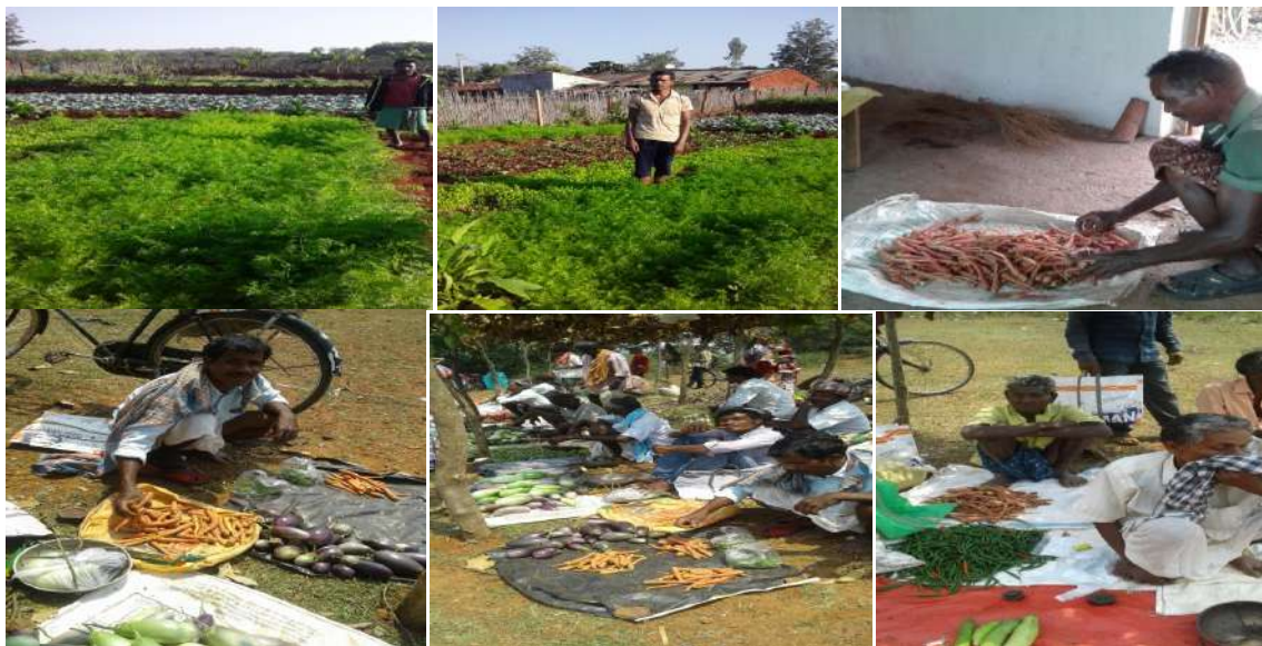
Fig: Cultivation, harvesting and selling of carrot by farmers of Sindurghati

Sindurghati village is situated 19 kms away from Kashipur Head Quarter. Farmers of this village are generally acquainted with cultivation of common vegetables like potato, tomato, brinjal, cabbage, cauliflower etc. But during FY 2018-19, twenty selected farmers were supported under RKVY for carrot and beet cultivation through OTELP PLUS Programme under ITDA, Gunupur by SHAKTI Organization. They were supported with 1 Kg of carrot seeds each farmer and incentives for cultivation. It was a first introduction to adapt a different vegetable for cultivation beyond the common ones. Ghasi Majhi S/O- Damru Majhi, Phul kumar Majhi S/O- Rati Majhi, Sadhu Naik S/O- Kumati Naik are some of the farmers who got good results. These farmers were able to yield about 1.5 to 2 Quintals of carrots from their field. After house hold consumption they sold their carrots in local weekly markets @40/Kg and earned money as additional income which they used to fulfill their house hold requirements. Another interesting thing is that vegetable like carrot and beet is rare to found at local weekly markets of tribal areas but now it is available which indicates journey of RKVY not only limit to income but also reaching at each people of the tribal areas by fulfilling their nutritional requirement.