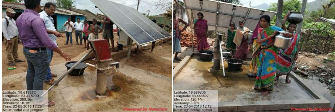
Fig: Solar Drinking water system in connection with tube well