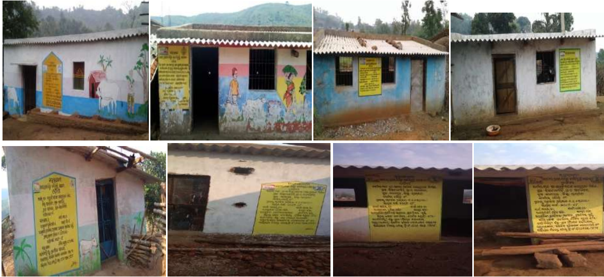
Fig: Cow Sheds at Musatakiri, Kantamal, Sindurghati and Kisankebidi villages