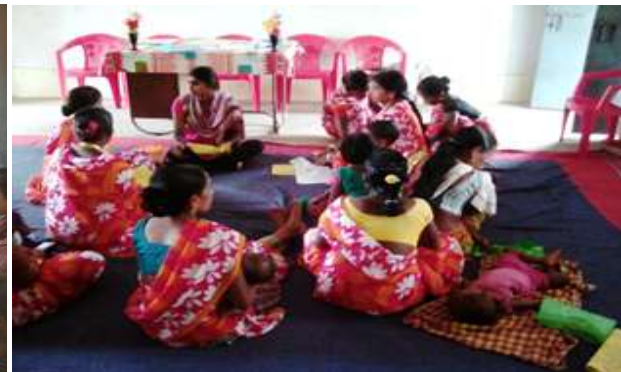
Fig: Awareness to villagers and outreach with SHG