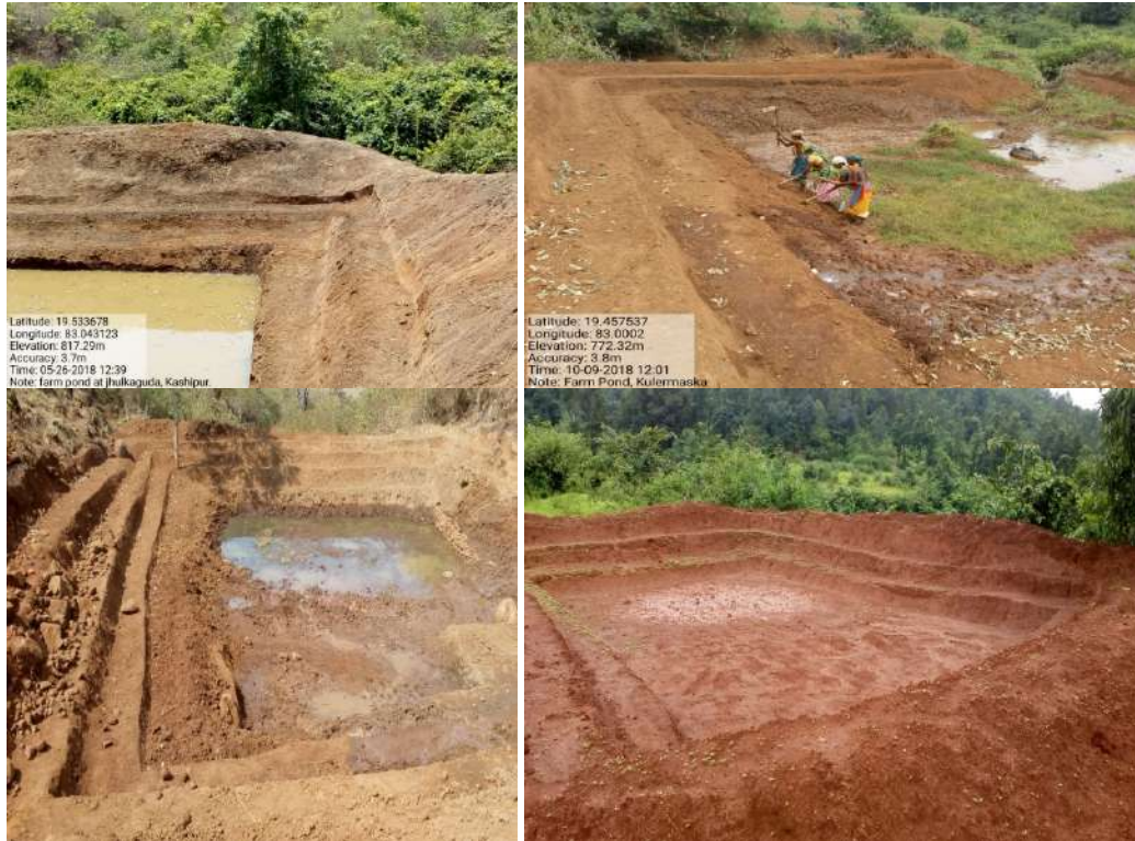
Fig: Farm Pond at different villages

Total 5 nos. of farm ponds were constructed through MGNREGA in five villages for the purpose of use of community during FY 18-19.