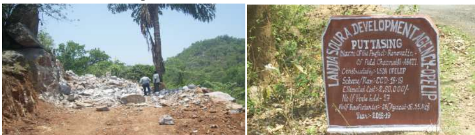
Fig- Formation of New road from Regedsing to Talgud and Renovation of Field Channel