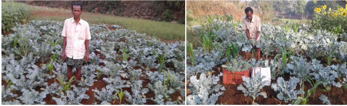
Fig: Baman Majhi at his broccoli field during cultivation and during harvesting

Sindurghati village is situated 19 kms away from Kashipur Head Quarter. Farmers of this village are generally acquainted with cultivation of common vegetables like potato, tomato, brinjal, cabbage, cauliflower etc. But during FY 2018-19, twenty selected farmers were supported under RKVY for carrot and beet cultivation through OTELP PLUS Programme under ITDA, Gunupur by SHAKTI Organization. They were supported with 1 Kg of carrot seeds each farmer and incentives for cultivation. It was a first introduction to adapt a different vegetable for cultivation beyond the common ones. Ghasi Majhi S/O- Damru Majhi, Phul kumar Majhi S/O- Rati Majhi, Sadhu Naik S/O- Kumati Naik are some of the farmers who got good results. These farmers were able to yield about 1.5 to 2 Quintals of carrots from their field. After house hold consumption they sold their carrots in local weekly markets @40/Kg and earned money as additional income which they used to fulfill their house hold requirements. Another interesting thing is that vegetable like carrot and beet is rare to found at local weekly markets of tribal areas but now it is available which indicates journey of RKVY not only limit to income but also reaching at each people of the tribal areas by fulfilling their nutritional requirement.