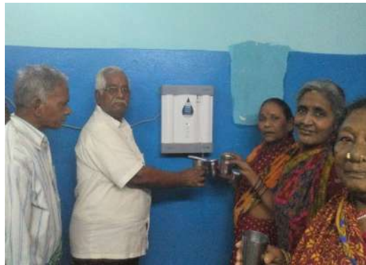
Fig: Use of water purifier by inmates of Senior Citizen Home

As water forms important constituent of human body and sufficient intake of water is required on regular basis for maintaining proper health therefore purified water is essential for avoiding water borne diseases and it is most essential for vulnerable persons like children and old age person. Keeping this ideology in view and with the support of generous donation through the Global Giving platform, one electric water purifier and for easy defecation in old age stage two nos. of commode latrines were purchased for use of inmates of Senior Citizen Home, Raygada having 25 inhabitants. They are now using it and feeling very happy.