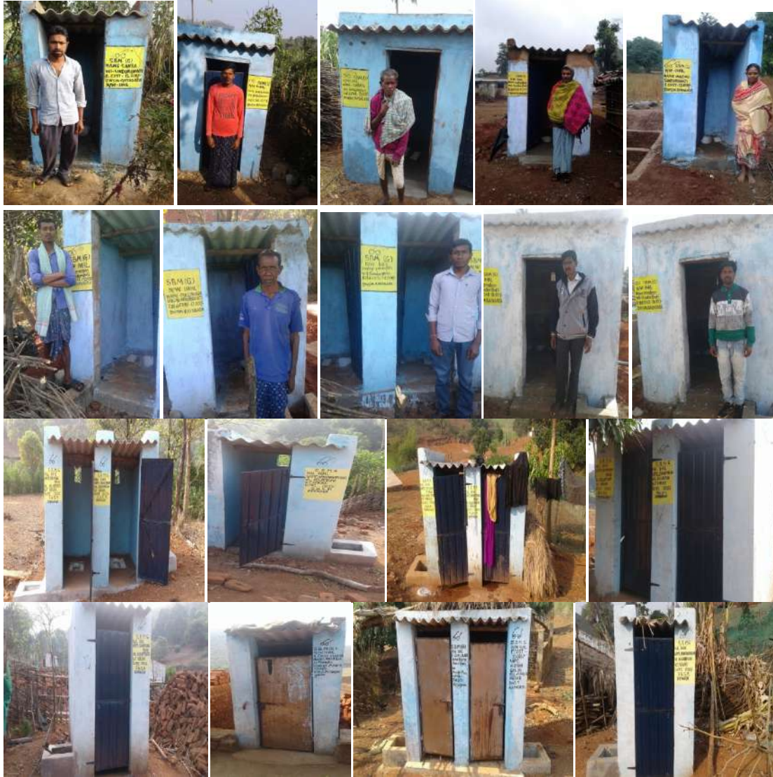
Fig: IHHL at Sindurghati, Kuliapadar, Pipalpadar villages through RWSS