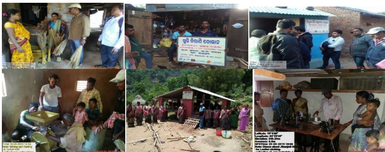
Fig: Support of different IGA units in different villages