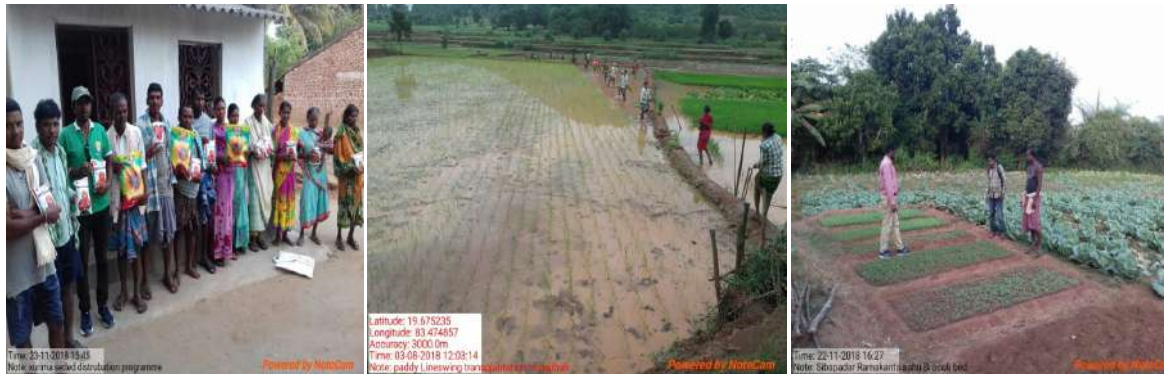
Fig: Agriculture activities like seed distribution, line sowing and vegetable cultivation facilitated by staffs of SHAKTI- OPELIP at Muniguda Cluster