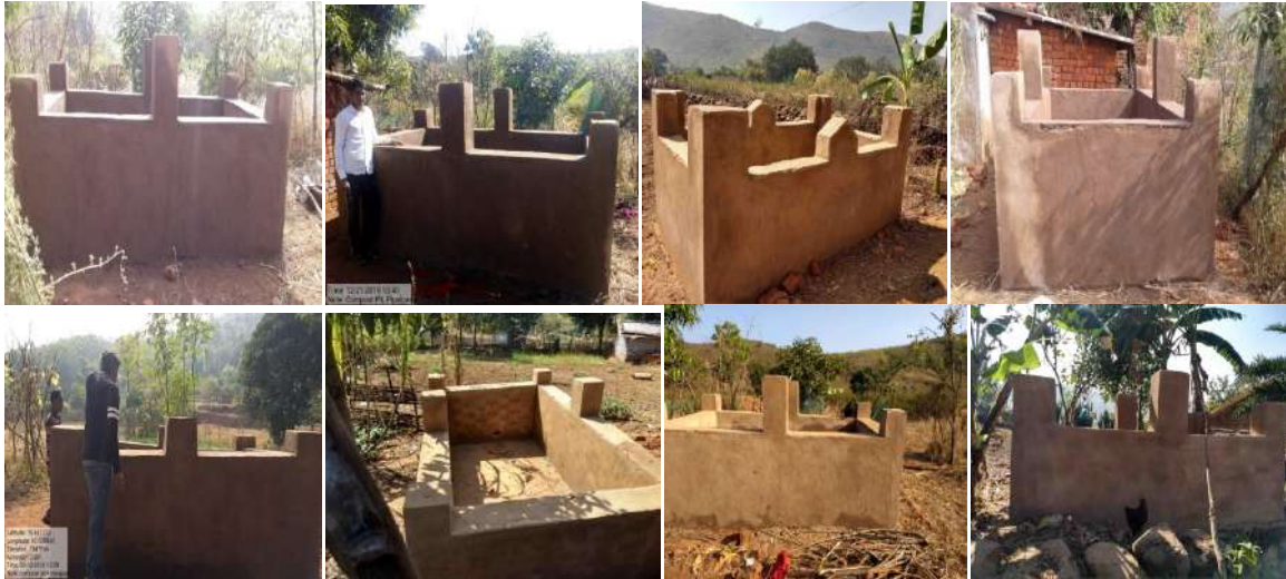
Fig: Compost beds at different villages

Total 18 nos. of compost pit were constructed in 5 villages through MGNREGA during FY 18-19 to encourage farmers for organic farming.