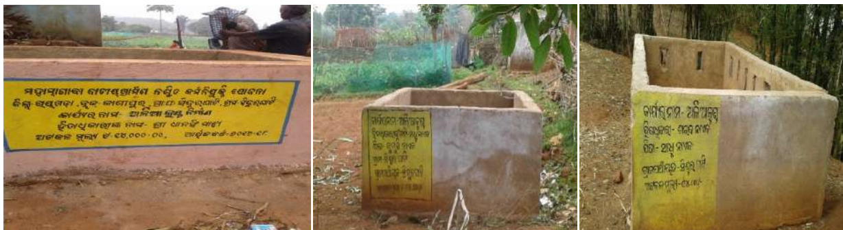
Fig: Dustbins at Sindurghati village