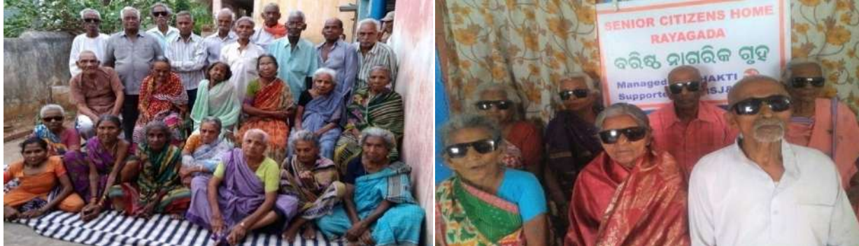
Fig: Senior citizens at Senior Citizens Home and cases after cataract operation