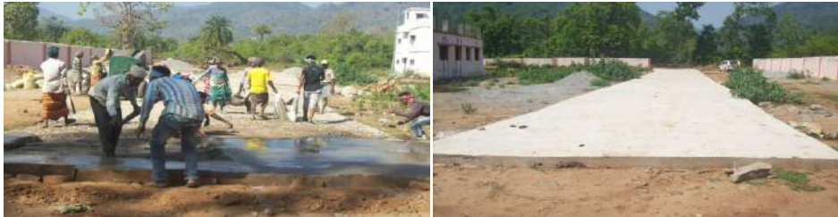
Fig: Construction of CC Road at Abada boy's complex