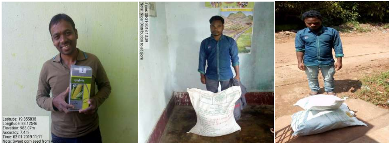
Fig: Supply of Sweet Corn and Niger seeds, super phosphate to Musatakiri and Adajore villages