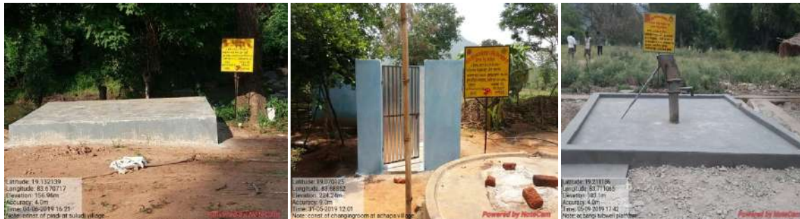
Fig: Different EPA activities at OTELP PLUS villages of Ramnaguda Block