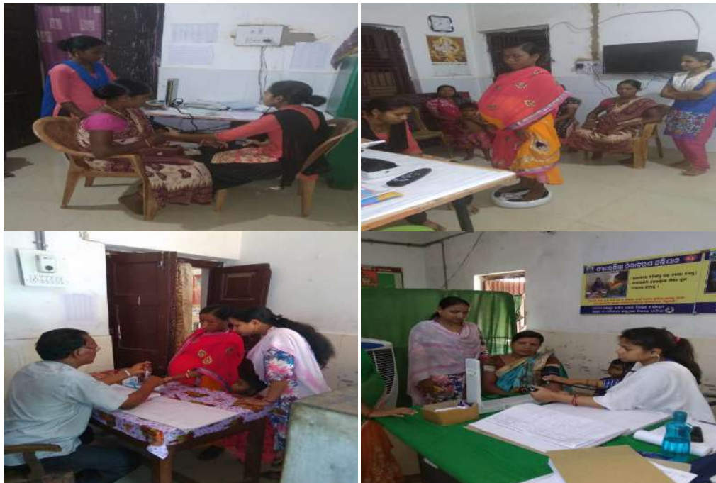
Fig: - Regular Health Check up of pregnant women facilitated by staffs of MWH, Kashipur