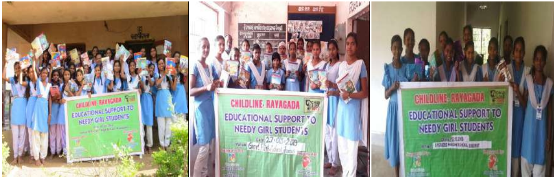
Fig: Educational support to needy girl students at different schools

Girl students are neglected in education in many parts of our country especially in rural areas. Though in Odisha, Government is supporting uniforms, books, mid day meal but still there is another requirement of girl students of poor families' i.e note books. With the support of generous donation through the Global Giving platform total 96 nos. of girl students were distributed with 418 nos. of note books for their educational support during FY 18-19 as Educational support to needy girl students.