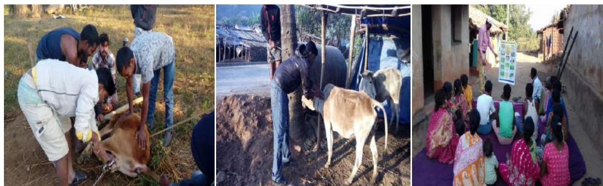
Fig: Animal Health Camp at different villages