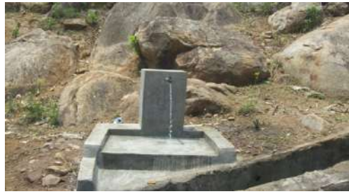
Fig- Renovation of Diversion weir at Angara and Renovation of Drinking Water