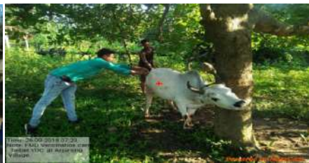
Fig- Training Programmes and Animal Health Camps at different villages