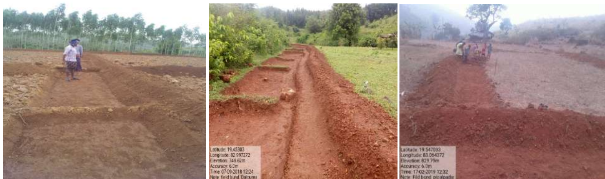
Fig: Field Bunding work in different villages

Field bunding work was done in 3 Ha areas at 4 villages during FY 18-19 through MGNREGA.