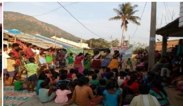
Fig: Open House Programme