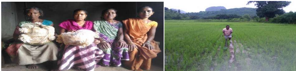
Fig: Mushroom Cultivation by SHG and use of mandava weeder at field supported by the Project