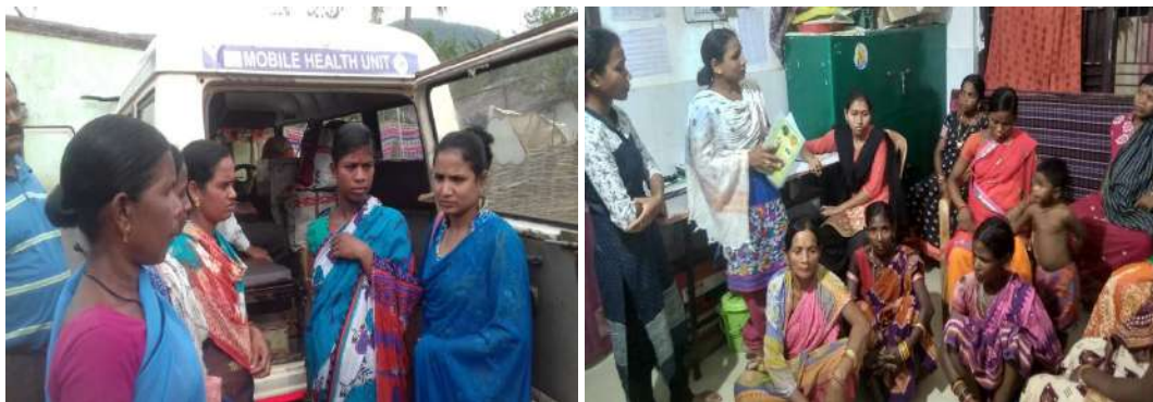
Fig: - Bringing of Pregnant women from remote area through Government vehicle and their counseling on maternal issues at MWH, Kashipur facilitated by staffs of MWH