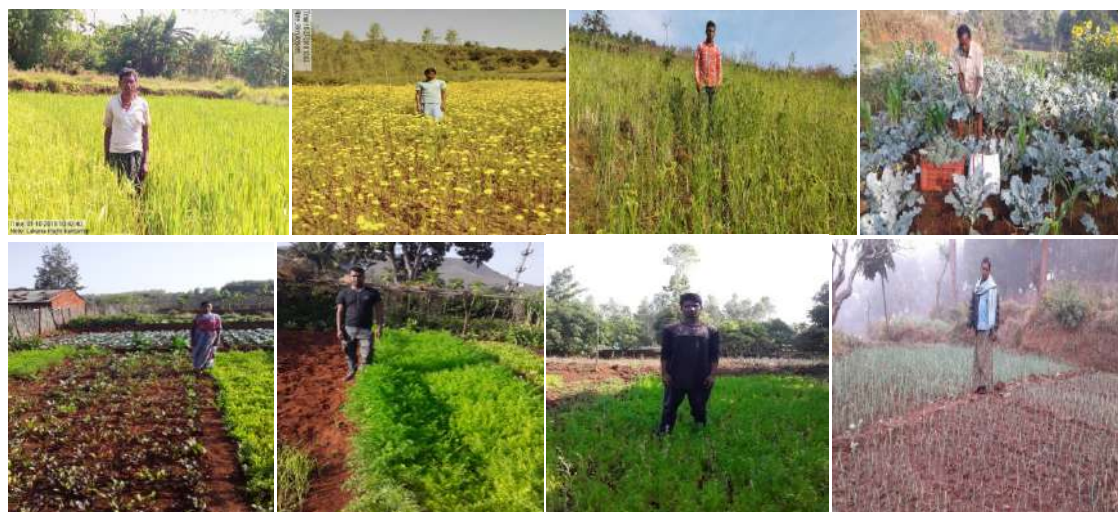
Fig: Cultivation under RKVY Schemes at different villages