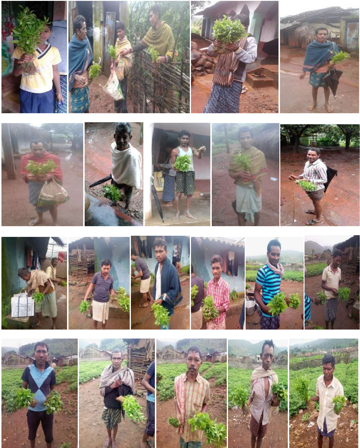
Fig: Supply of vegetable seedlings (Tomato, Brinjal, Chilli) from Hort. Dept at Kuliapadar, Kantamal, Sindurghati villages