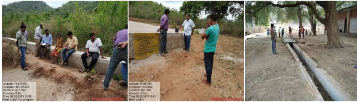
Fig: Activities like Guard wall, Threshing Platform and Drain in different villages