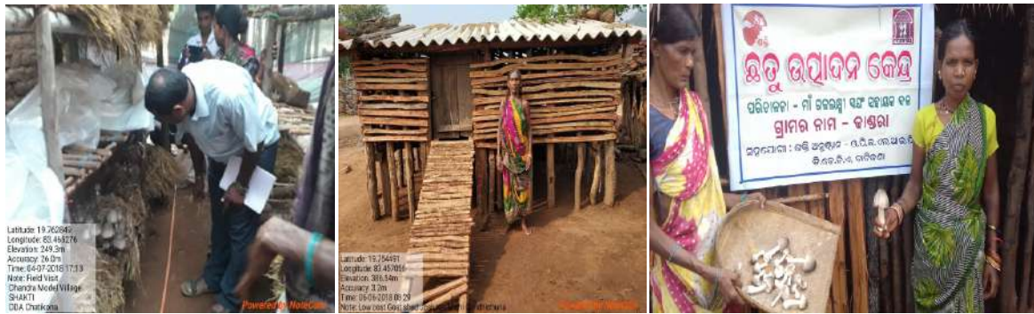
Fig: IGA Units including Mushroom and Goat rearing units at OPELIP villages, Muniguda