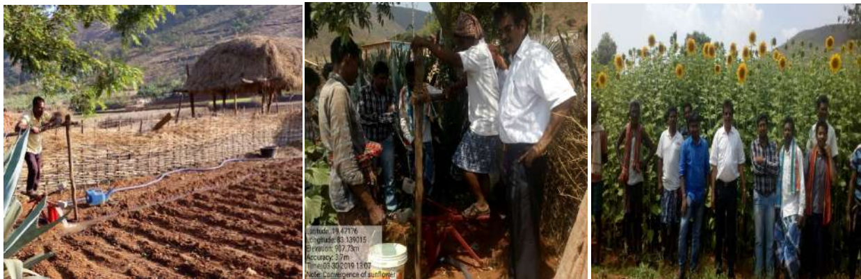
Fig: Supply of treadle pumps and sunflower cultivation at Kantamal Village