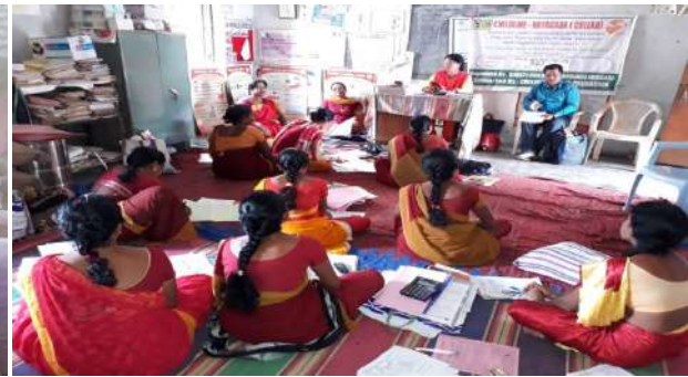
Fig: Outreach at village and Anganwadi Center