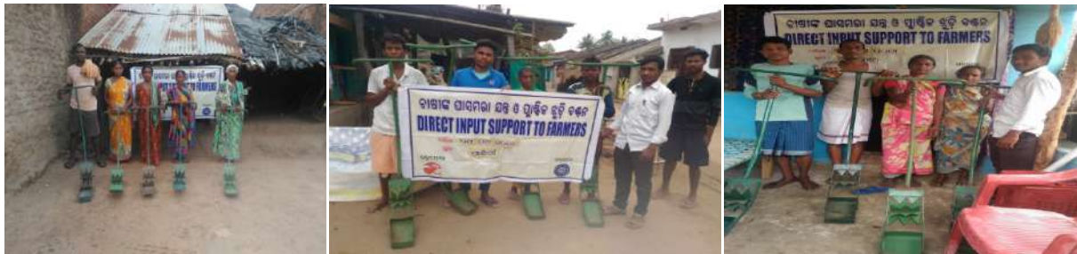
Fig: Direct Input support to farmers at different villages