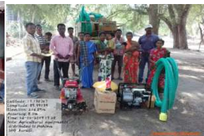
Fig: Support of agriculture devices to SHGs