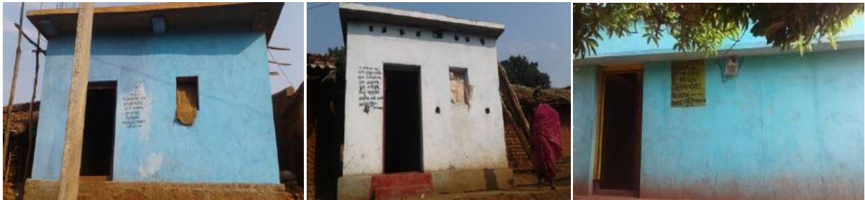
Fig: PMAY at Kuliapadar and Pipalpadar villages