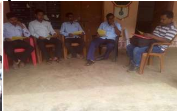
Fig: Awareness at School