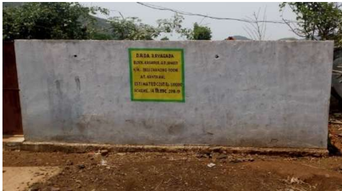
Fig: Bathing cum dress changing room at Kantamal