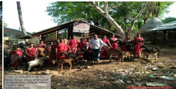
Fig: Support of Poultry and Goat rearing units to SHGs