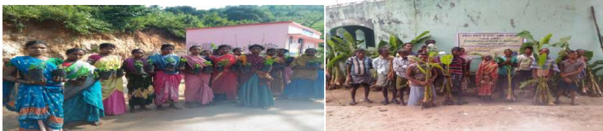
Fig: Distribution of Papaya and Banana seedlings at Programme areas

SHAKTI- CWS Project playing important role in livelihood enhancement of indigenous tribal people through organic farming, kitchen garden development, negotiating people with schemes of Agriculture and Horticulture Department and providing small handhold supports like supply of inputs such as vegetable seedlings, mandava weeder, plastic baskets etc. Apart from this it plays role in empowerment of people through capacity building of community with themes of schemes of Agriculture, Horticulture Department, organic farming, mushroom cultivation, SRI method of cultivation, trellis method of cultivation and conduct exposure visit of farmers to see best practices and to gain knowledge through observation. Activities of this Programme are implemented at two GP Tarama and Gajigaon of Rayagada District covering 14 villages. During FY 2018-19 hundred families are supported with kitchen gardens. They are supported with brinjal, tomato, banana, drum stick, papaya, ivy gourd seedlings and tubers for development of kitchen gardens to enrich people with nutrition at their back yards. Inputs like 40 nos. of mandava weeders and 50 nos. of plastic baskets are also supplied to farmers in the Programme areas. No doubt implementation of this project improved the livelihood pattern of rural tribal mass especially in agriculture activities beyond their traditional practices.