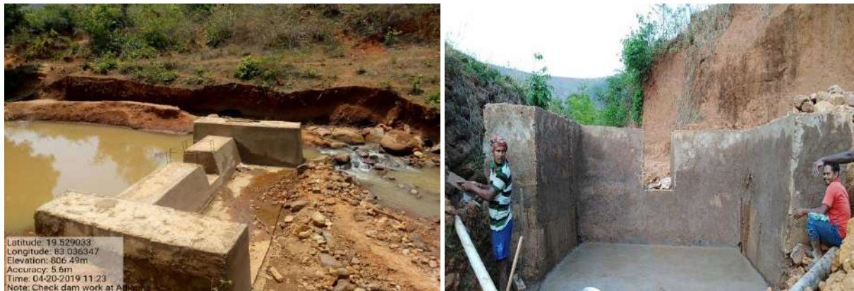
Fig: Check dam works at Adiguna and Kantamal villages during construction

Total 2 nos. of check dams were constructed in two villages through MGNREGA during FY 18-19 to enable people with irrigation facility through perennial streams to their cultivated lands.