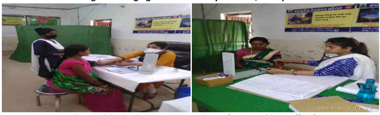
Fig: Regular Health Check Up at CHC, Kashipur facilitated by staffs of MWH