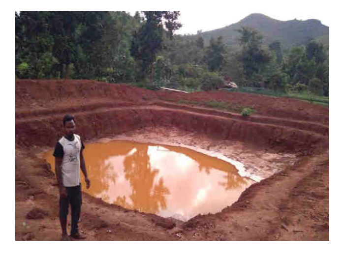
Fig: Farm Pond at Adajore