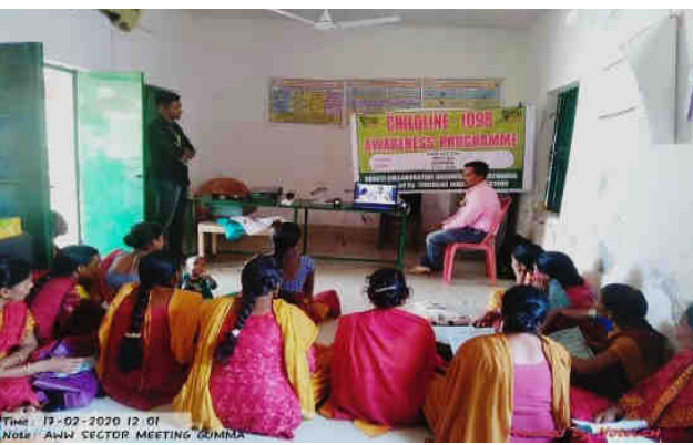
Fig: Outreach at Anganwadi Centers