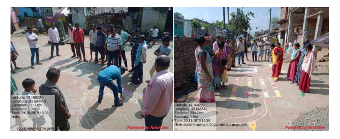
Fig: Village Resource Mapping during VDLP Preparation