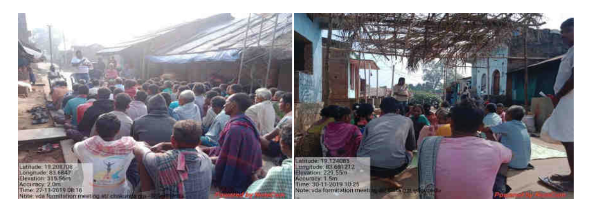
Fig: Meetings on formation of VDA