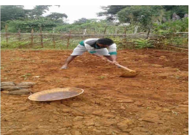
Fig: Yam cultivation at Sindurghati village