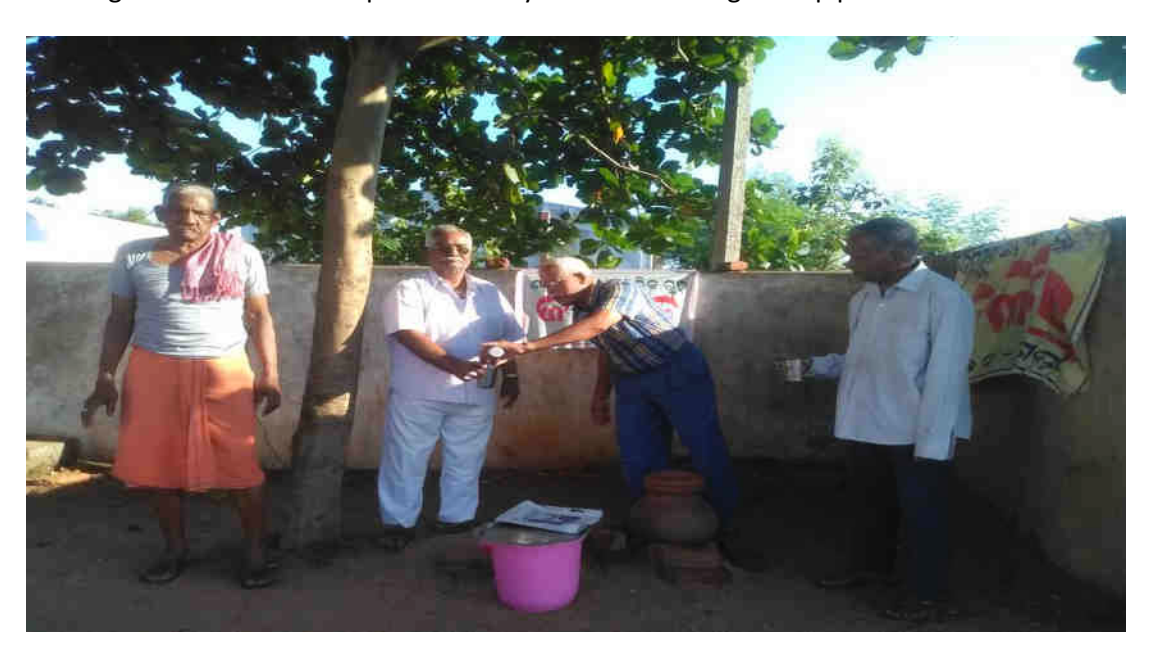
Fig: Water distribution during summer by inmates of Senior Citizens' Home