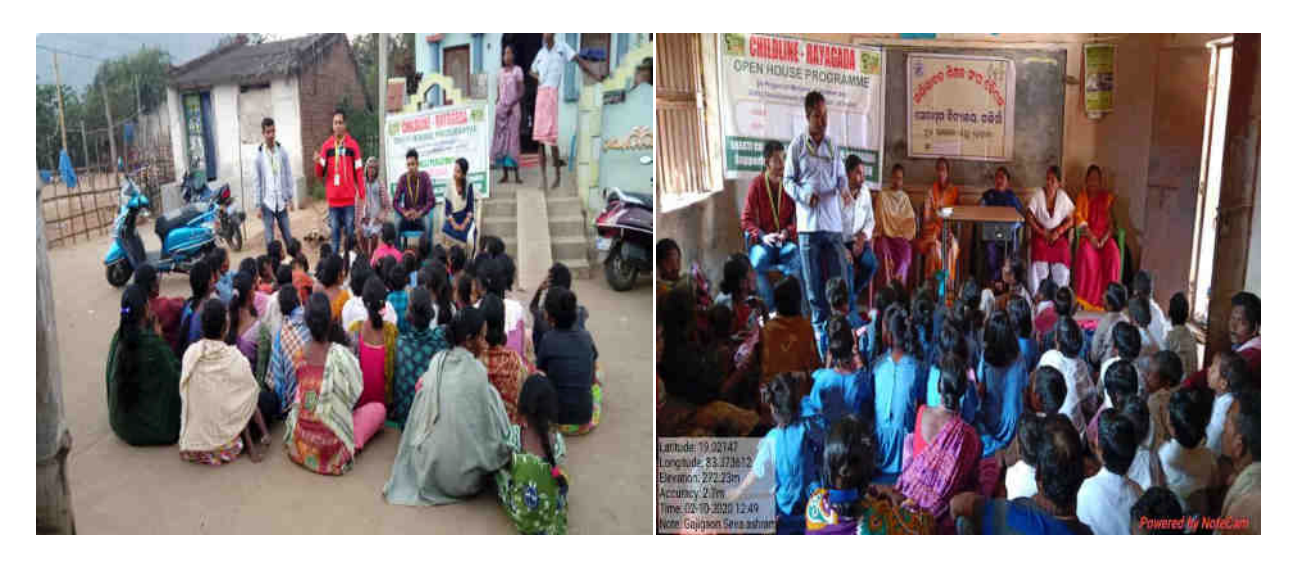
Fig: Open house Programme