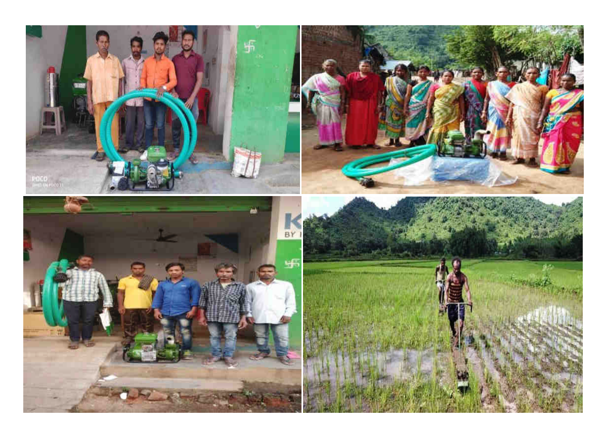
Fig: Support of agro inputs by SHAKTI-CWS