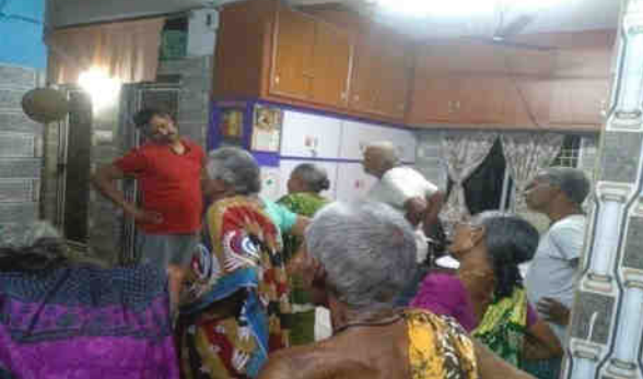
Fig: Regular Health Check up at Senior Citizens' Home