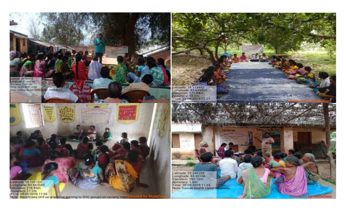
Fig: Different Capacity Building Programmes at OTELP PLUS Area, Ramanaguda