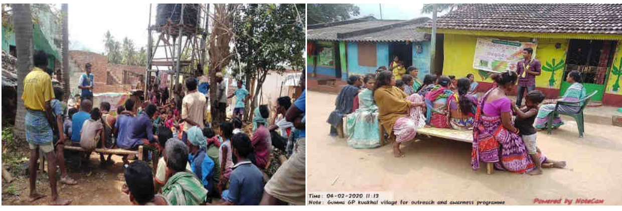
Fig: Awareness to villagers