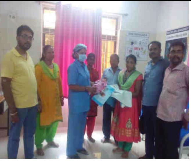
At-District head quarter Rayagada