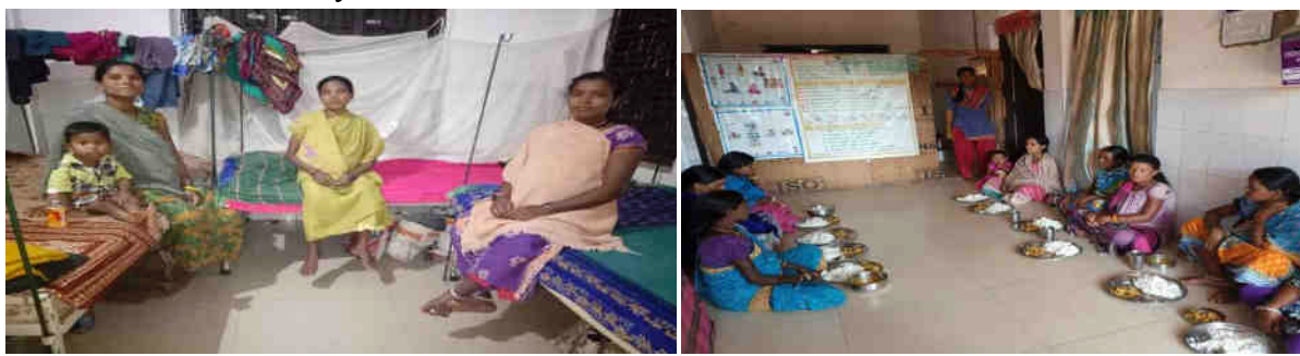
Fig: Free lodging and food facility at MWH, Kashipur