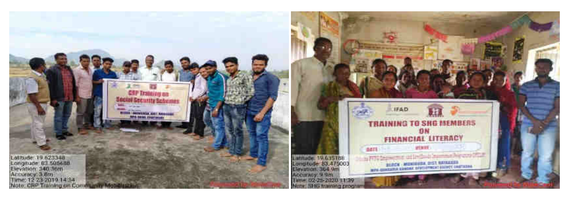
Fig: Capacity Building Programmes in Muniguda Cluster

Total 35 nos. of capacity Building Programmes conducted during FY 2019-20 for CRP and SHG members on the themes of Book keeping, Annual Work Plan Preparation, Financial Literacy, Social security schemes, Community mobilization including one exposure visit.