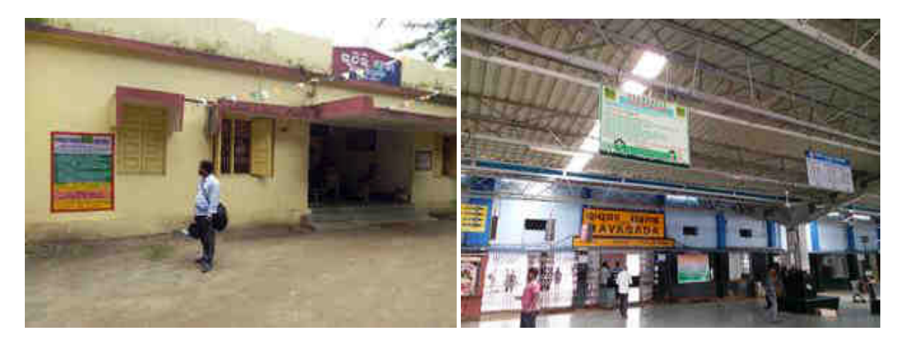
Fig: Childline wall message at Police Station Fig: Childline hoarding at Railway Station