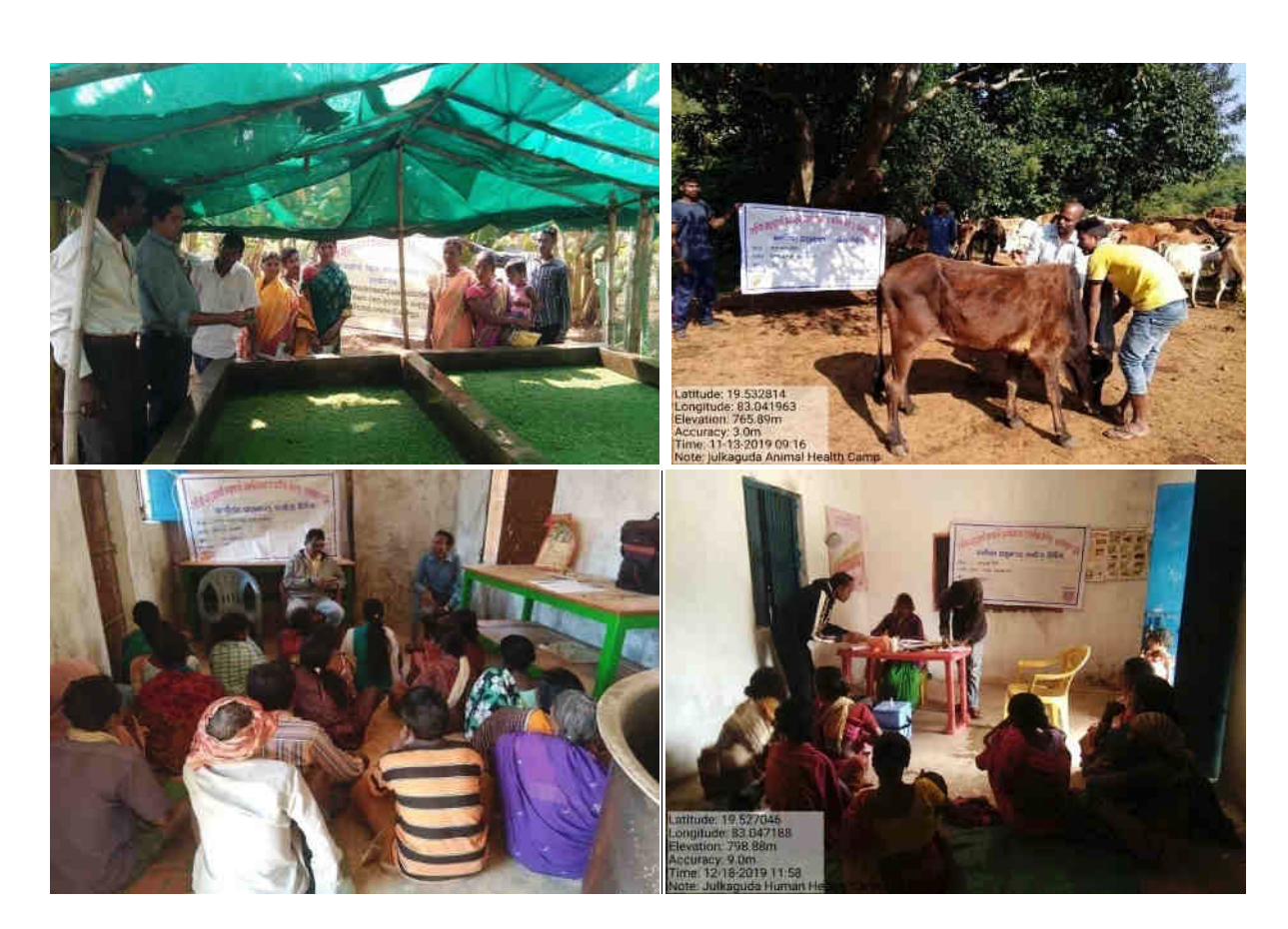
Fig:- Different Capacity Building Programmes of OTELP PLUS, Kashipur during FY 2019-20