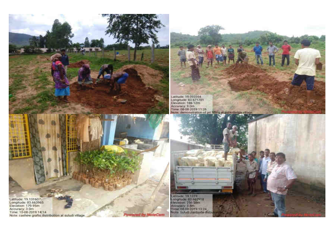
Fig: Support for WADI Plantation by SHAKTI-OTELP PLUS, Ramanaguda