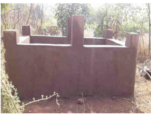
Fig: Compost pit at Pipalpadar