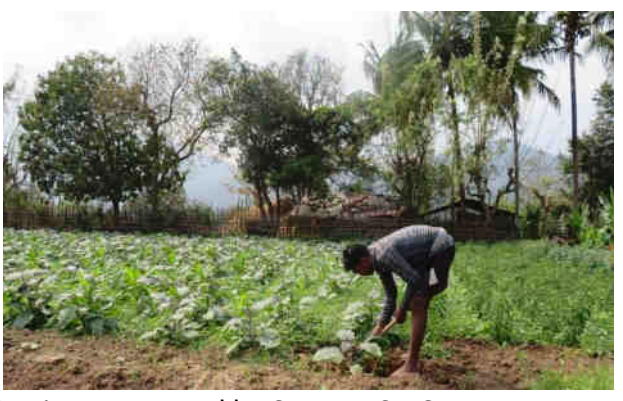
Fig: Seedling distribution and cultivation supported by SHAKTI-CWS