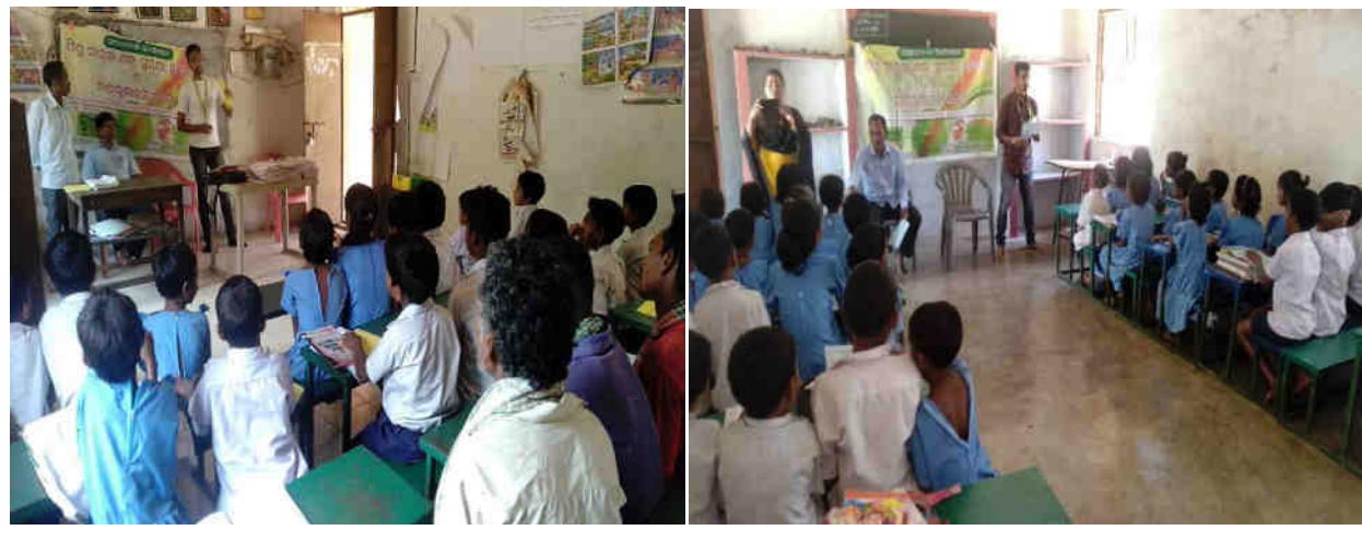
Fig: Awareness at school