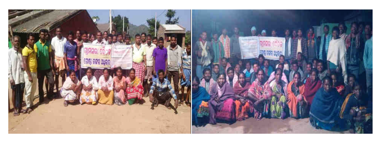
Fig: Community Forest Right Committees