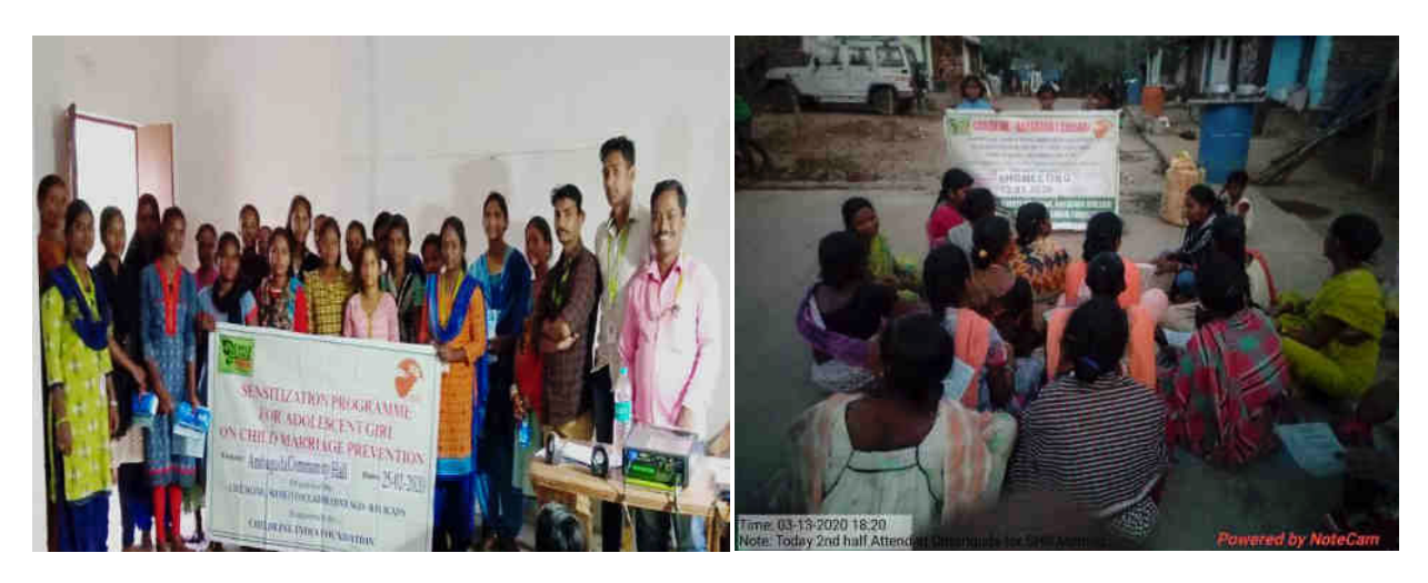
Fig: Sensitization Programme on adolescent girls Fig: Outreach with SHG functionaries