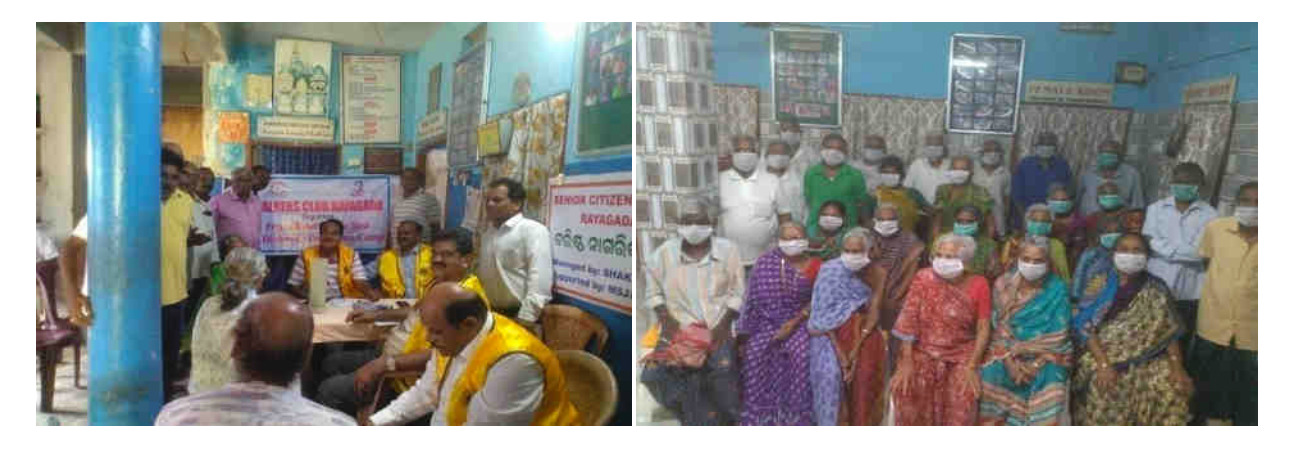
Fig: Awareness Camp on Health issues at SCH Fig: Use of Mask by inmates of SCH to prevent corona