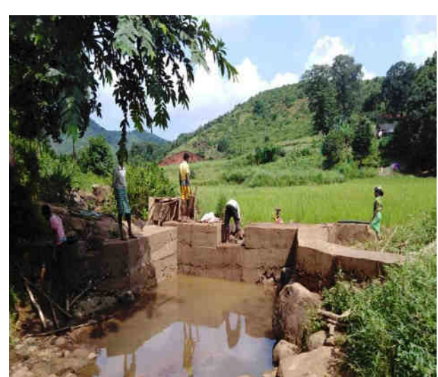
Fig: Check dam at Jhulkaguda