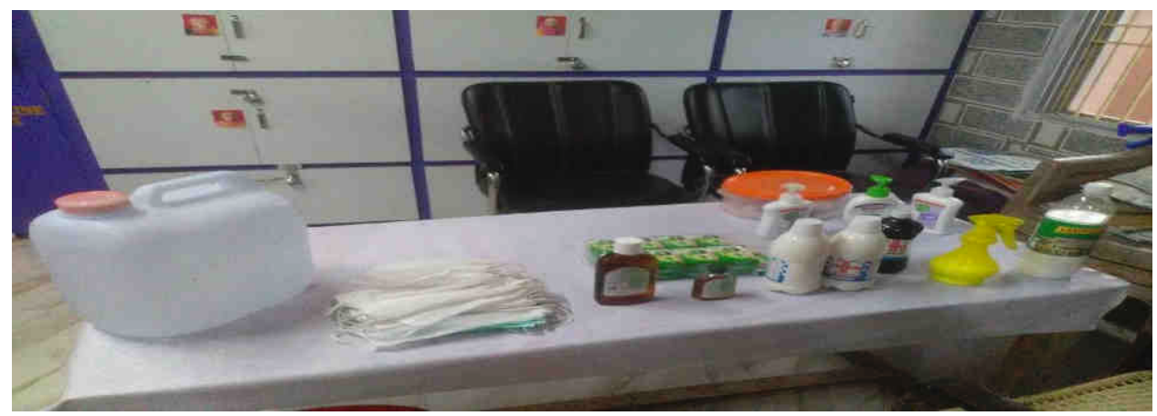
Fig: Distribution of mask, sanitizers at Senior Citizens' Home including awareness on use by inmates to get rid of corona as preventive measures