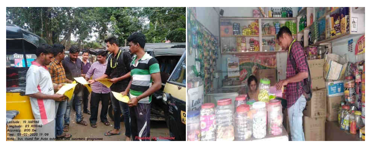
Fig: Outreach with Auto Drivers