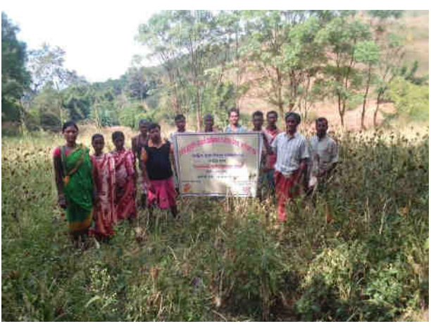
Fig: Ragi cultivation at Kantamal village