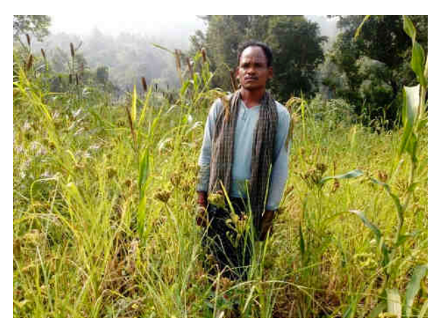
Fig: Ragi cultivation at Musatakiri village