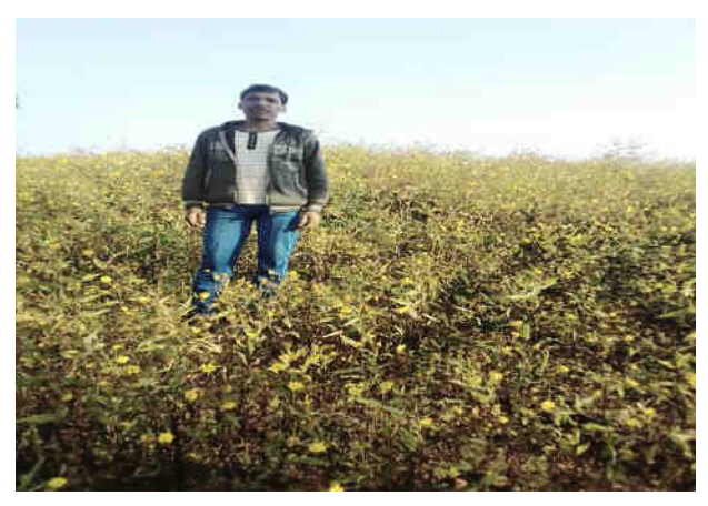
Fig: Niger Demonstration at Adajore village